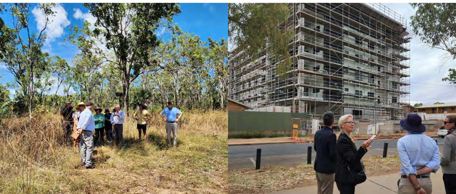
Table 1 (con't): Planning Commission meetings in 2022-23