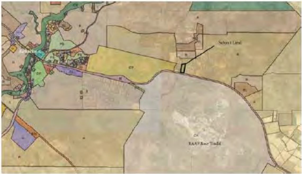
Map 1: Showing Site, Surrounds and Zoning

Map 1 shows the site, surrounds and the zoning.