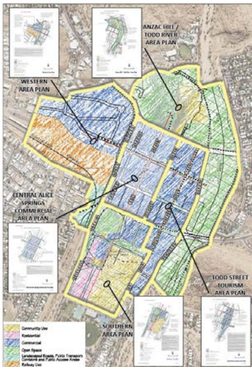
The current Area Plans being reviewed

All feedback from this stage of consultation will help us develop a draft Area Plan for further consultation.