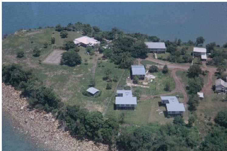
(Above) Aerial view of Myilly Point featuring the houses of senior public servants in January 1964.

A number of public service houses destroyed in Cyclone Tracy were demolished, and all that remains is four pre-war houses which were designed by renowned architect B.C.G. Burnett and built in what is now the Myilly Heritage Precinct. They were used by the Commonwealth Public Service until they were badly damaged by Cyclone Tracy in 1974.