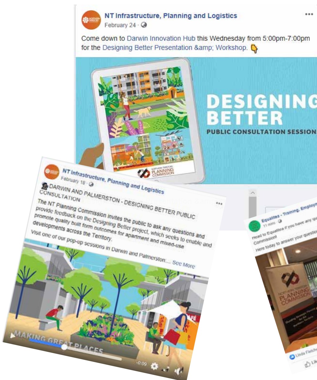
Figure 4: Department Social Media posts

A dedicated page on the Planning Commission website was employed. The web page included consultation materials, times and dates of pop ups and forums as well as contact details for the community to get in touch with the project team or make submissions.