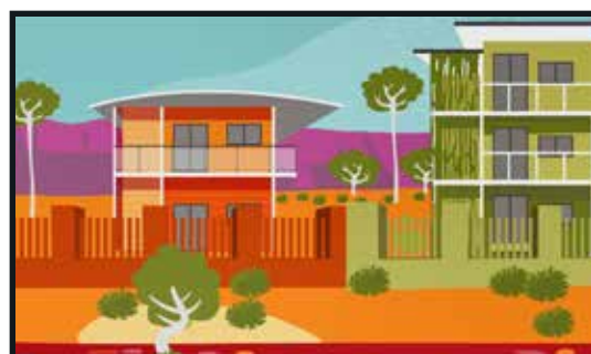
Figure 12: Stills from animation used for consultation