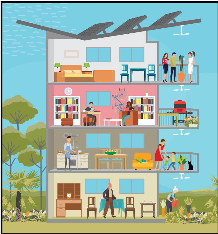
Figure 11: Illustrations from the snapshot booklet

At pop up events the community was supportive of innovation and variety in design which supported people needs. In particular some senior Territorians made comment that they would support ground level apartments that are aimed at our aging population and meeting specific needs.