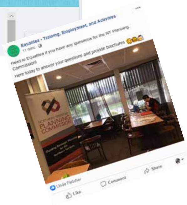
Figure 5: Pop up venue Social Media post