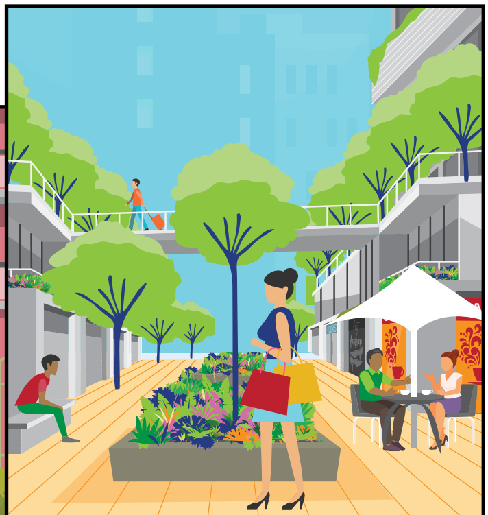
Figure 10: Illustrations from the snapshot booklet

While no specific feedback was received on this idea, discussions held with the public were supportive of the ideas suggested around making great places and the importance of adapting to the needs of the community.