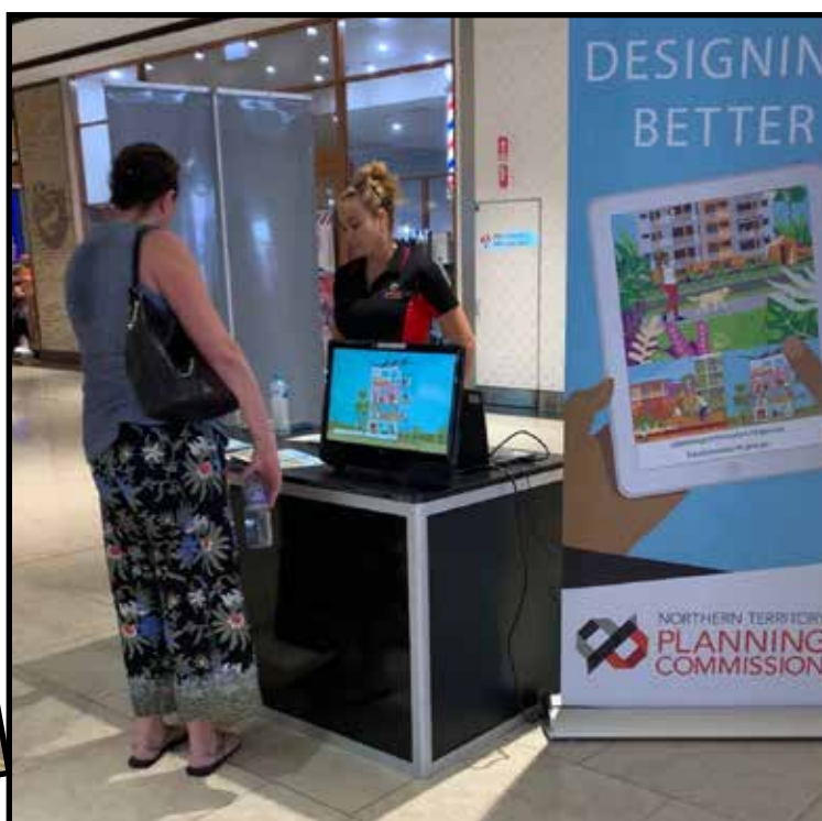
Figure 3: Public consultation