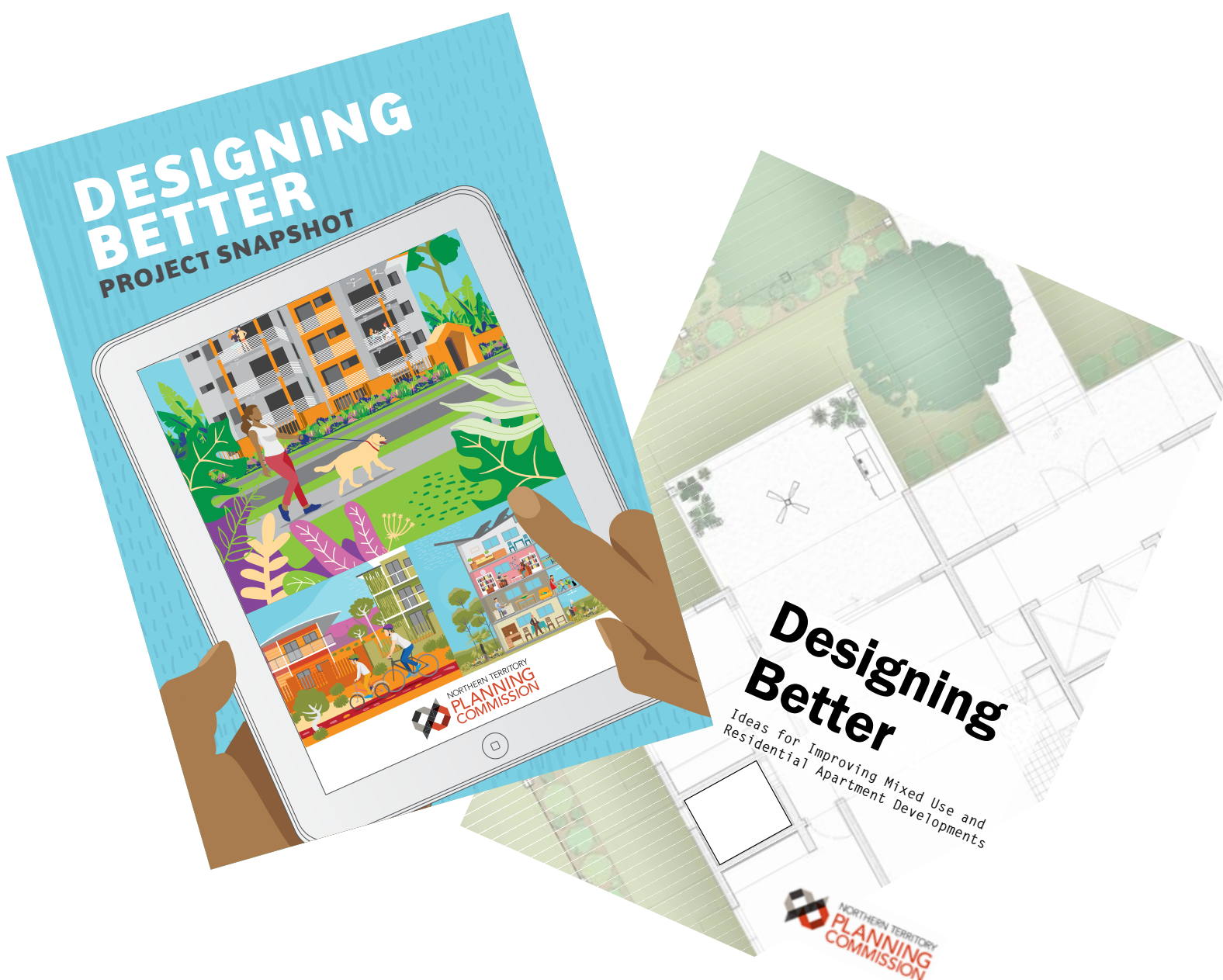
Figure 2: Consultation material

Stage 1c engagement centred on a project snapshot booklet that provided a simplified and accessible overview to the general public of the ideas that this project is seeking to implement.